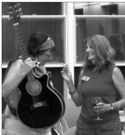
"No Talent Talent Show" Skit

After a welcoming of new and returning members, we began a great sharing meeting