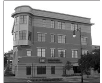
The American Cancer Society of Grand Rapids' "Hope Lodge".

Please join us this February, as we sing in support of our community, our loved ones, and our lives.