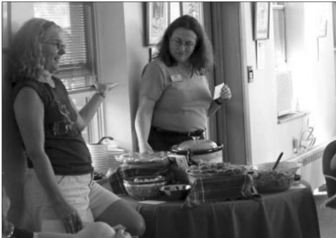
Chorus members' Cultural Dinner presentation

The group gathered on Saturday, September 27th, with our voices, minds, and souls to learn about this season's music, and to learn about each other. After finding spaces for our overnight accommodations, we began with proper warm-ups! Then it was time to sing, and sing we did.