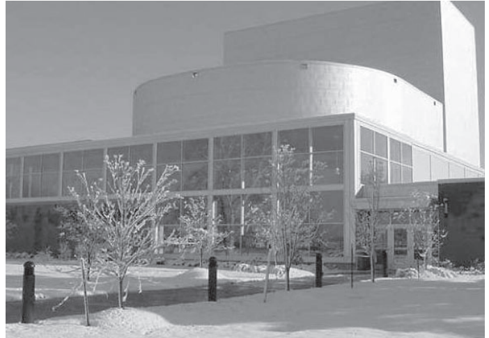
The Dogwood Center for the Performing Arts in Fremont, Michigan.

In addition to Fremont, the Center supports interest in the arts in many other communities, including Whitehall, White Cloud, Newaygo and other nearby towns. The Chorus is honored to accept their invitation to perform here in May.