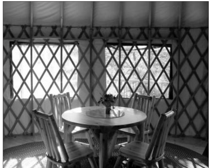
Inside one of the Yurts at the Franciscan Life Process Center

To unwind later, some of us joined in a drumming and percussion and dancing and anything goes circle, while others joined in a lively book discussion. Then it was off to bed in various locations. One of the most unique dwelling spots was in one of the two yurts the Sisters have very nicely set up on their property. Sunday the Board members held the annual business meeting during lunch, where all the members discuss and